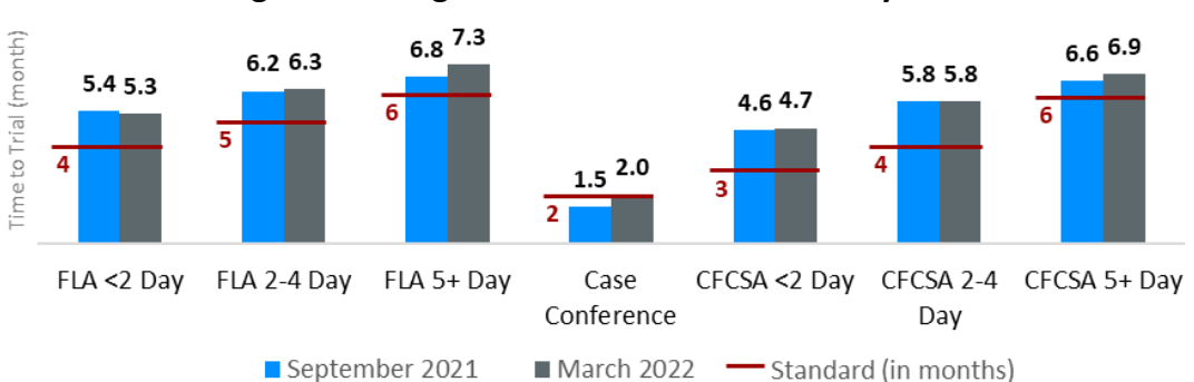
Figure 4 - Weighted Provincial Time to Family Trials

Figure 4 includes two types of proceedings: family case conferences and trials. The time to a family case conference is the number of months between the date a judge directs a conference to be set and the first available date for a family case conference. Although the time to a case conference increased (but is still within the standard), the overall number of case conferences scheduled has decrease significantly as a result of changes to the Provincial Court Family Rules that came into effect in May of 2021. Most of the case conferences are now for CFCSA files only. The time to trial sets out the number of months between a family case conference and the first available court date for typical FLA or CFCSA trials of various lengths. These results do not take into account the time between a first appearance in Court and the family case conference. Since September 2021, most FLA and CFCSA results increased, with the exception of short FLA trials (under two days) and medium CFCSA (2-4 Days) trials, which decreased slightly or stayed the same.