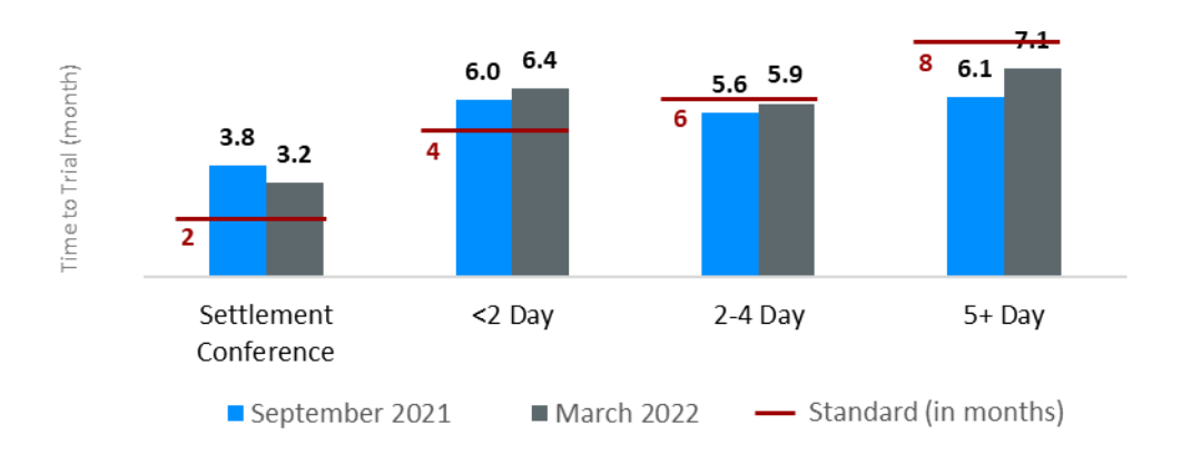
Figure 5 - Weighted Provincial Time to Small Claims Trials

Figure 5 includes two types of proceedings: settlement conferences and trials. The time to a settlement conference is the number of months between the date the last reply or document is filed to ready the case for a settlement conference and the first available date for a settlement conference. The time to trial is the number of months between the end of a settlement conference and the first available court date for typical small claims trials of various lengths. These results do not take into account the time between the filing of a claim and the reply. Since September 2021, small claims trial results have increased, while time to a conference decreased.